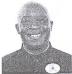
Charles Francis Margai Presidential Candidate: