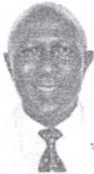
Kandeh Baba Conteh Presidential Candidate: